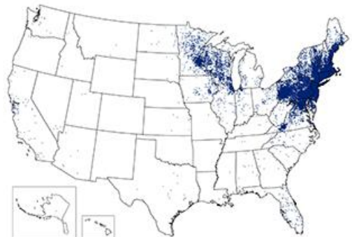
Reported Cases of Lyme Disease -- United States, 2015

1 dot placed randomly within county of residence for each confirmed case